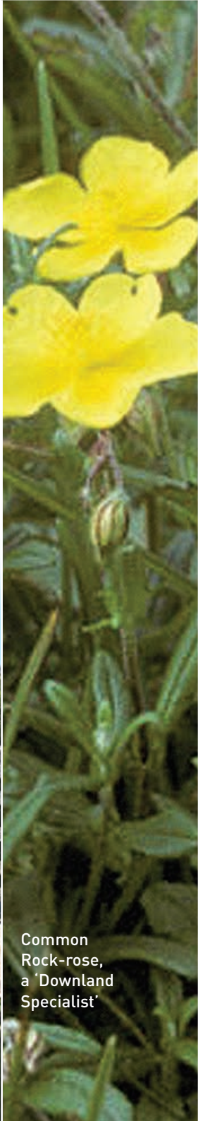
Common Rock-rose, a 'Downland Specialist'